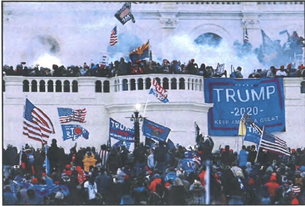
Photograph of the Capitol on January 6, 2021 112