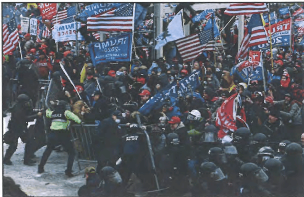
Photograph of the Capitol on January 6, 2021 117