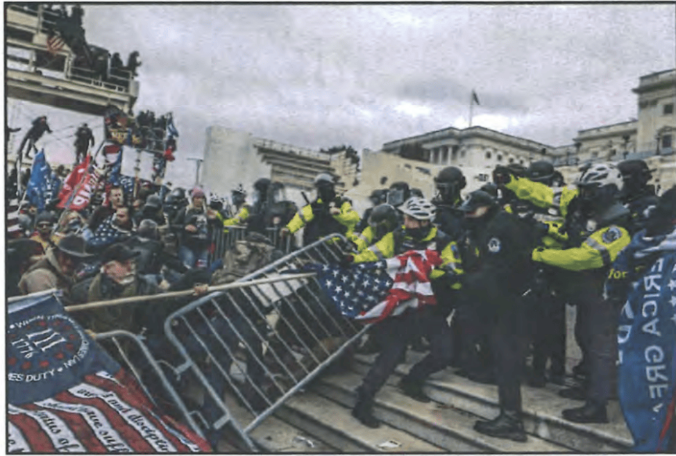
Photograph of the Capitol on January 6, 2021 116