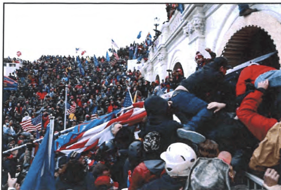
Photograph of the Capitol on January 6, 2021 114