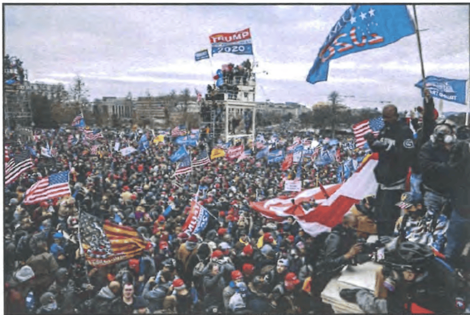
Photograph of the Capitol on January 6, 2021 113