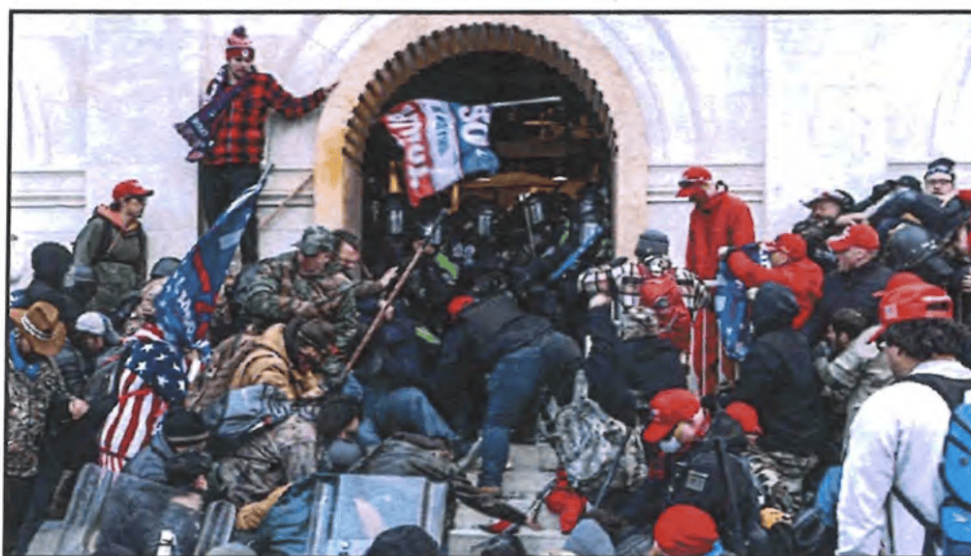
Photograph of the Capitol on January 6, 2021 115